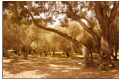
Half Moon Bay ( above ); Lake Tahoe ( above right ); The Olive Grove at Filoli ( right ). ▲