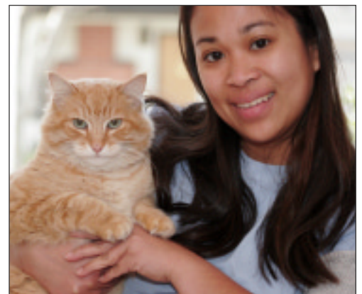
Everybody sing: "Smelly cat, smelly cat, what are they feeding you?"